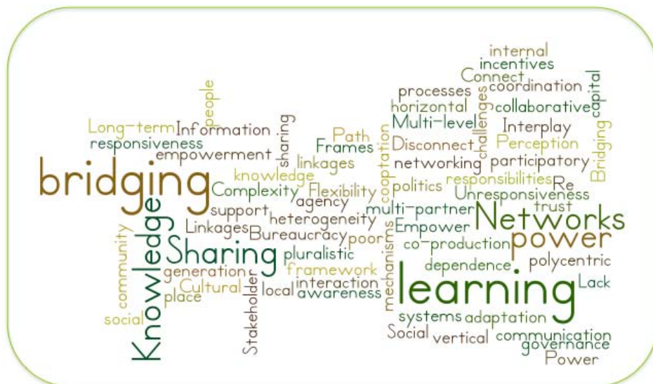
Figure 2. Visualization of key ingredients of governance identified by CCRN members in 2014 (generated using Wordle software). The size of the word is proportional to the number of times the word appeared in surveys; i.e. the larger the word, the more frequently mentioned.

To identify 'key ingredients' of governance helpful in engaging communities in conservation, we surveyed CCRN members (academic researchers and community practitioners), who were asked to reflect on their individual experiences with governance and community conservation, in order to answer seven open-ended questions on a range of governance-related themes. CCRN members identified a diversity of key ingredients of governance from their sites and projects (Figure 2).